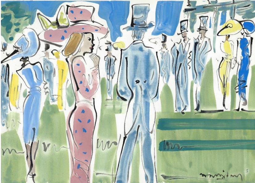
Royal Ascot by Alan Halliday. Watercolour on paper, 19cm x 29cm, 1995.

Available for £475 from the Camburn Fine Art stand at the Art & Antiques Fair, Olympia.