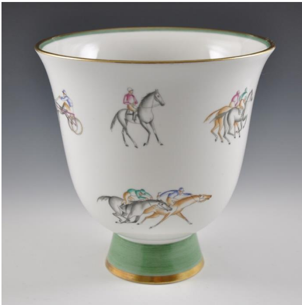
Sport Equestri (Horse sports) by Gio Ponti – porcelain vase made for Richard Ginori, manufactured in 1937.